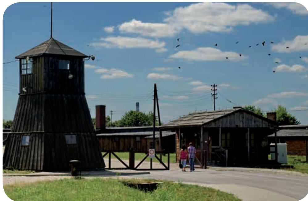
Majdanek State Museum