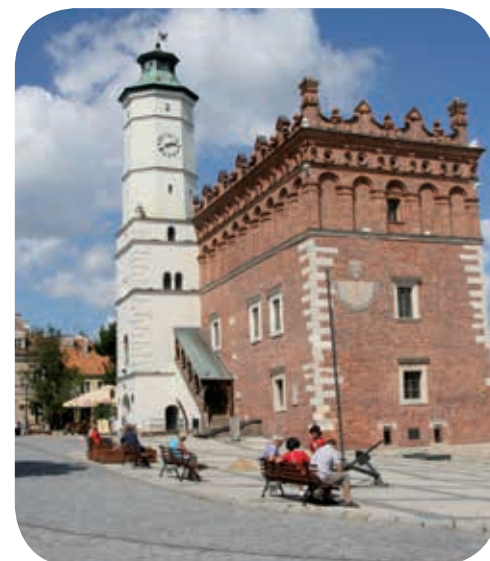
Town Hall, Sandomierz