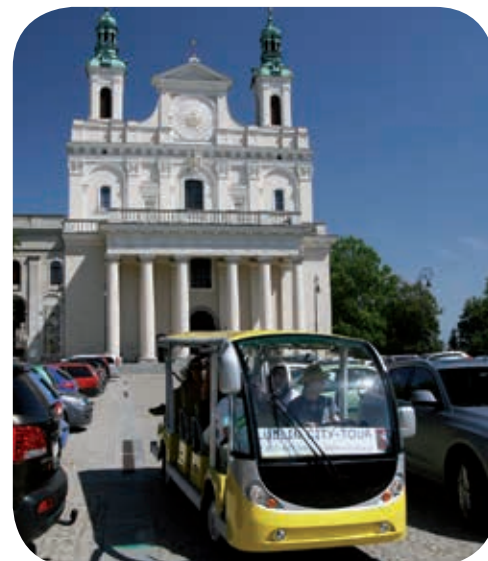
Lublin City – Tour bus. In the background – Lublin Cathedral.