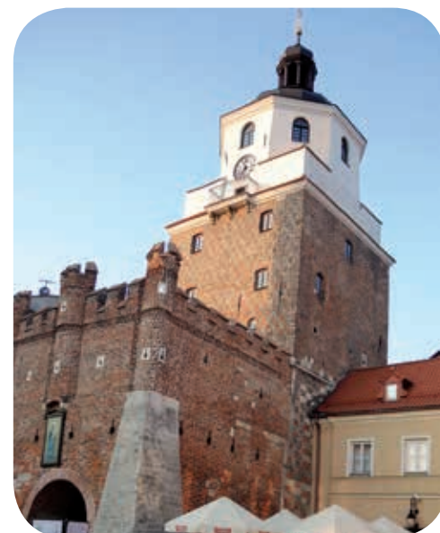
Cracow Gate, Lublin