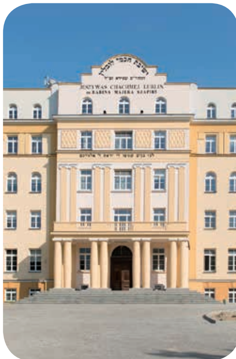
Yeshivat Chachmei, Lublin