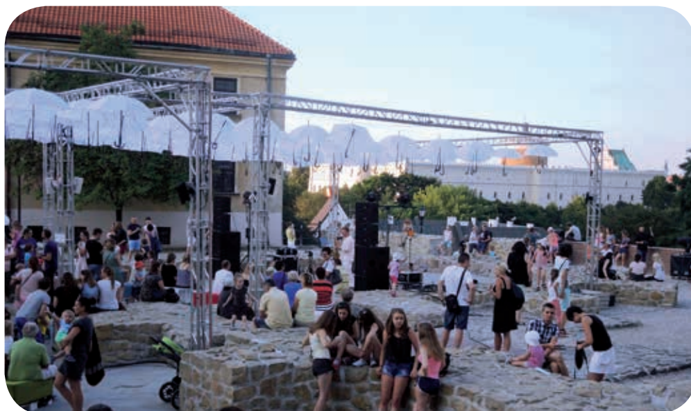
Po Farze Square, Lublin