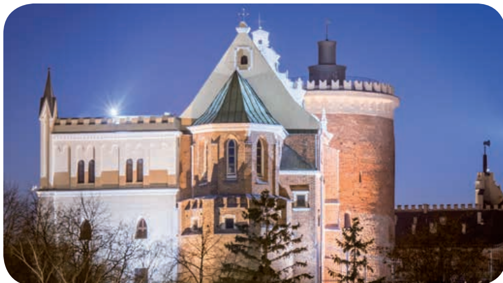
Lublin Castle: Holy Trinity Royal Chapel and the Romanesque tower, Lublin