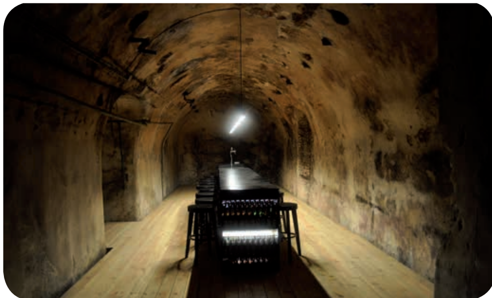
Underground Tourist Route