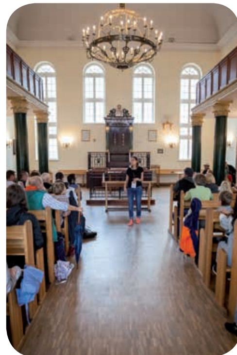
Yeshivat Chachmei, Lublin