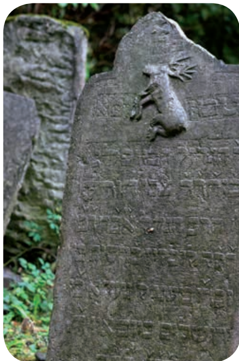
The Old Jewish Cemetery, Lublin